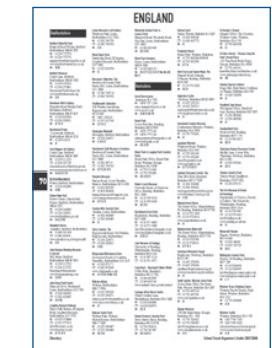
▲ How your advert could look in School Travel Organiser's Guide .