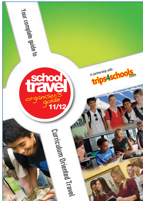
▲ An example of the School Travel Organiser's Guide front cover.

What is the impact from School Travel Organiser's Guide? Offering invaluable and easy-to-use information, the guide offers teachers something truly unique. Not only are the editorial features and case studies interesting and informative, the school travel directory lists approximately 2,000 venues – all with links to curriculum subjects making planning throughout the year easy. A reference tool constantly used ensures advertisers have their messages seen time and time again throughout the year as well as a readership far outweighing one person, per copy.